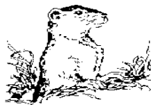
Groundhog Day

Knights of Columbus ~ Pancake Breakfast ~ Sunday, February 14 at Saint Paul Parish, 820 Carbon Road, Greensburg. 8 a.m. until 12 noon. Cost 12 yrs to adult—$5. 11yrs and under $2.50. Sponsored by Knights of Columbus 1480 Foundation. Benefit of Saint Paul Parish.