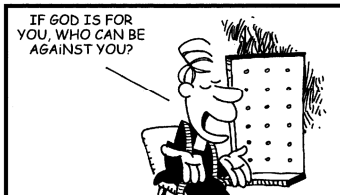
2nd SUNDAY OF LENT

So here's another thought. If someone told you he or she had been transformed by one of these experiences, what would it take for you to believe it? What would it take to describe it?