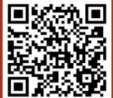
Christ the King

The summer months include many celebrations, parties and picnics; graduations, birthdays, anniversaries. It is only natural when you are invited to a party to think about the gift that you will bring. Even when the invitation says, "No gifts, please," most of us still show up with a bottle of wine, gift card or some other token of our affection. We bring gifts to show our gratitude for being invited and to show our love for the one being honored and celebrated. So, when God Himself invites you to the greatest celebration of all – the celebration of the Eucharist – do you bring a gift? Do